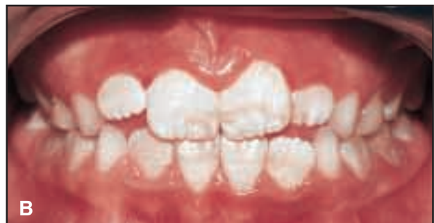
Fig. 8 A. Stability of correction after eruption of first permanent molar. B. Stability after eruption of permanent incisors, with tracks still covering occlusal surfaces of deciduous molars.