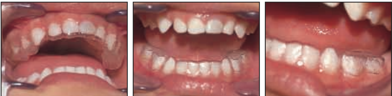
Fig. 3 Acetate trays before being filled with light-cured composite.

An acetate transfer tray is constructed for each arch (Fig. 3). The deciduous molars are etched with 37% orthophosphoric acid for 15 seconds. The acetate tray is then loaded with