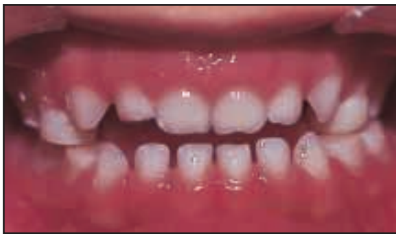
Fig. 6 PDTs bonded directly to deciduous molars.

light-cured composite in the areas of the tracks. No composite should be loaded in the incisor region, as these teeth are the reference points for setting the transfer trays. The composite resin is cured for at least 40 seconds on each molar surface. We have found it more comfortable to build the lower PDTs first, but the tracks should be placed in both arches at the same appointment.