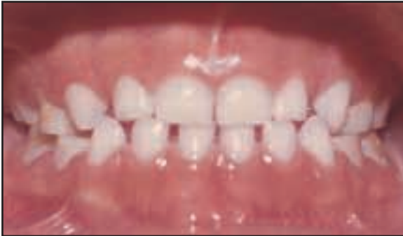
Fig. 7 Crossbite correction after two months of wearing PDTs. Note minor diastema between deciduous incisors and better alignment of anterior segments.

and permanent incisors (Fig. 8). The PDTs remained on the deciduous molars until they exfoliated. The patient reported no problems with eating during this entire period.