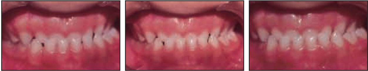
Fig. 5 4½-year-old female patient with crossbite from right lateral incisor to left second deciduous molar before treatment.