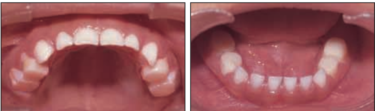
Fig. 4 PDTs bonded to deciduous molars.